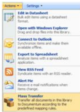
Figure 1: v-Pass Mass Transfer Feature

advanced ECM platforms and the years of investments in processes, retention policies and compliance.